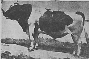
Coffeydale Sir Bess PEARL - 1029659 (GP)