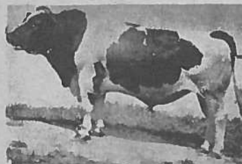
Coffeydale Sir Bess PEARL - 1029659 (GP)

Michigan Artificial Breeders Co-operative, Inc.