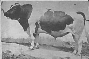
Coffeydale Sir Bess PEARL -1029659 (GP)

Michigan Artificial Breeders Co-operative, Inc.