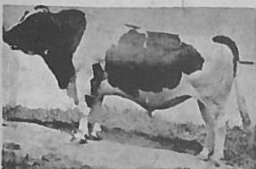
Coffeydale Sir Bess PEARL ----1029659 (GP)

Michigan Artificial Breeders Co-operative, Inc.