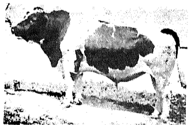
Coffeydale Sir Bess PEARL ----1029659 (GP)

Michigan Artificial Breeders Co-operative, Inc.