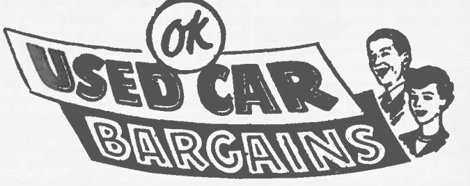
READY FOR WINTER DRIVING!!!

Ralph Bergquist was admitted to CMC Hospital Dec. 16.