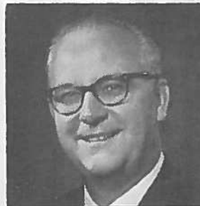
U. S. Congressman CEDERBERG