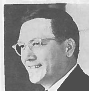
U. S. Senator GRIFFIN