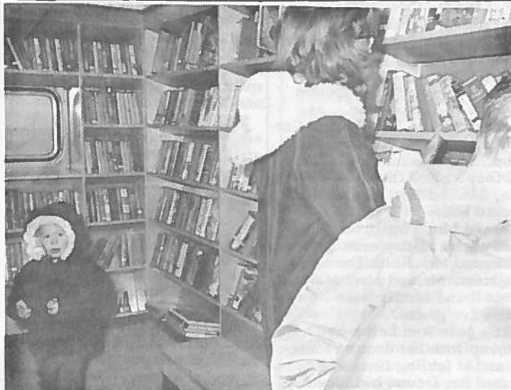
ALL AGES BROWSE FOR BOOKS-- Scene inside the bookmobile which comes to Weidman every other Wednesday, from the Mt. Pleasant Library, in co-operation with the townships.