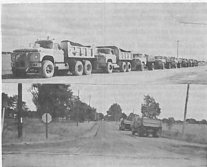
WEIDMAN GETS STREET PAVING AT LAST! --County road trucks lined up, loaded with blacktop material, starting on the School Road last week (above photo, top), to feed into the heat-equipped macadam-laying machine which rolled the stuff into beautiful new roads in Weidman. Bottom photo shows the beginning of the paving on the School Road. Also paved were Main Street past Palmer's Bar, Bridge Street (the Mill road) past Mitchell Memorial Park, and half a mile of road south of town past the Branson homes, to meet the School Road south as it heads for M-20. Weidman has waited many years for street paving.

Just for the record--We had big snowflakes in appreciable volume in Weidman last Friday, Sept. 29. That's about the earliest we can remember getting the white stuff.