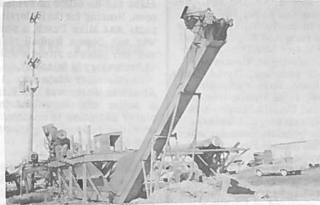
THE MORBARK LOG PEELER--Looks like this. It's an automatic peeler that skins the bark off raw logs without human labor. It is one of the great innovations of modern-day sawmill operation. Maeder Brothers' Sawmill a mile east of Weidman has had the Marbark peeler since last March.