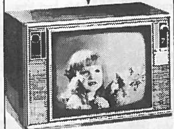
The VAN DYCK • Y5918W Decorator-Compact Table Model Color TV featuring vinyl clad metal cabinet in grained Walnut color.

NO BATTERIES... NO WIRES... NO CORDS... nothing between the user and the set but space!