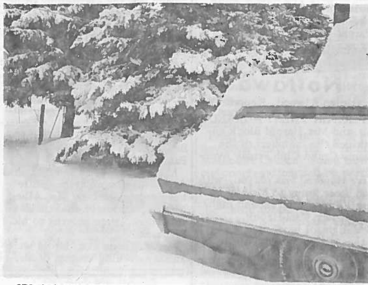
SPRING IN MICHIGAN, 1967--Tuesday morning, March 21, Spring came to Weidman with a snowfall of over six inches of new white stuff and little indication of immediate softening of the weather. We can only hope that by the time you read this paper, it may be gone. That's March in Michigan.