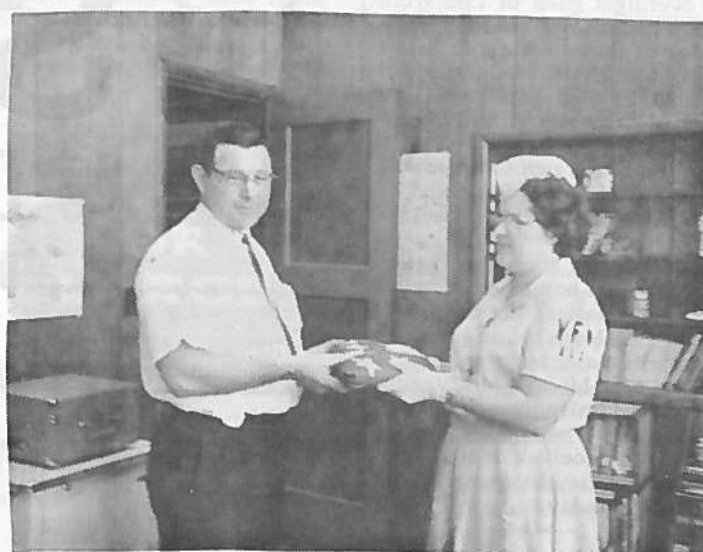
THE BORLEY-HANEL VFW AUXILIARY NO. 3033 of Mt. Pleasant presented the Weidman Community School with a new outdoor American flag last week.

It comes out in the wash that Ye Ed should have recognized all the youngsters in the old photo of the Weidman School of 1933 we printed last week. Our alibi is the fact that we had only the film to gaze at, before the paper was printed, so we couldn't see