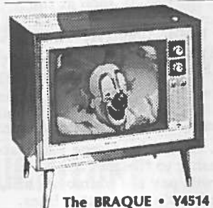
The BRAQUE • Y4514 Beautiful Contemporary styled compact console in grained Walnut color (Y4514W), or in grained Mahogany color (Y4514R). Super Video Range Tuning System.