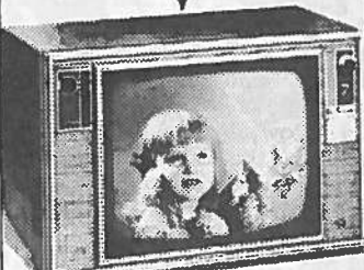
The VAN DYCK • Y5918W Decorator-Compact Table Model Color TV featuring vinyl clad metal cabinet in grained Walnut color.

"300" VHF REMOTE CONTROL TV TUNING No need to turn TV off manually at the set. Adjust volume to two levels, mute sound; turn set on or off, change VHF channels in one direction. NO BATTERIES... NO WIRES... NO CORDS... nothing between the user and the set but space!