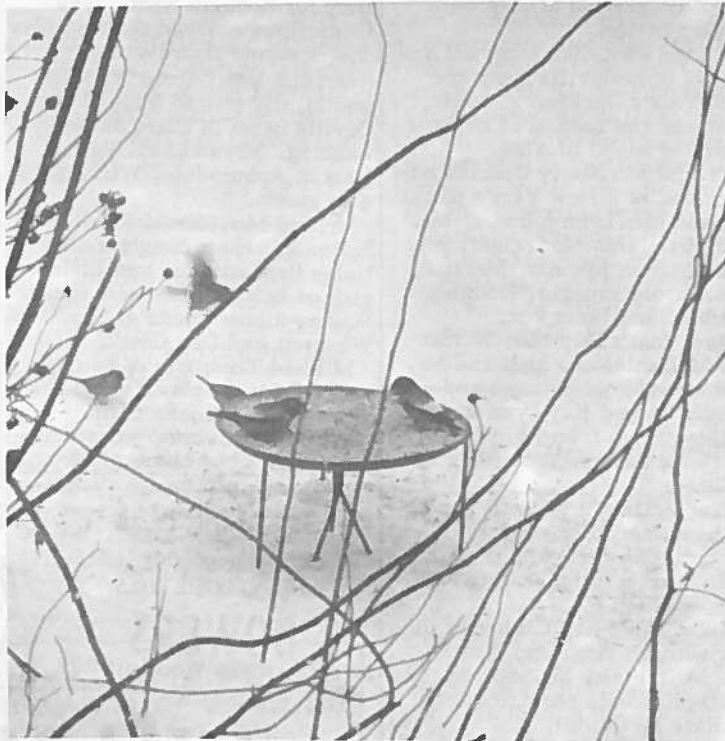
A FEW OF OUR WINTER BIRDS--At our feeder just outside the dining-room window. It takes time and patience to get a bird picture, as the little rascals are frightened by a camera. They don't seem to object to us "big folks" at the window, but they definitely are camera-shy. We managed to get a couple of evening grosbeaks and the smaller birds coming to the feeder. Photo taken through our rose-brambles outside the window.

We also have, of course, the cardinals, and in great numbers this winter; the ever-present bluejays, amazingly big when they come close to the house; and of course the charming little chick-