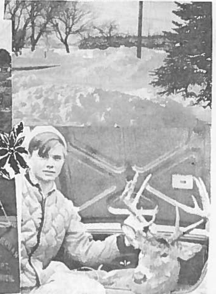
Hunting was good