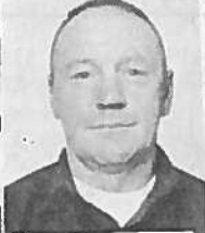
New Fire Chief