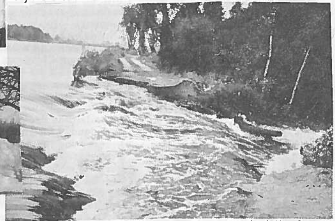
We had flood rains in June