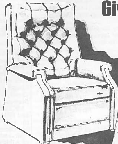
BERKLINE MODERN TV RECLINER