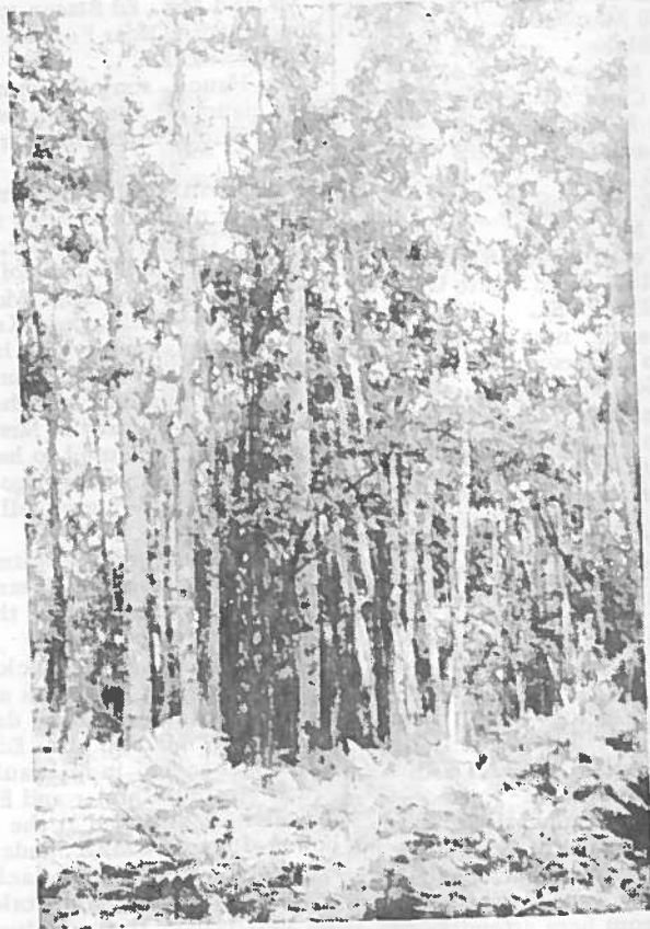
SUMMER ON THE ISLAND