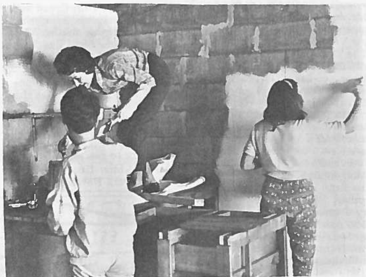
THEY PAINTED LIBRARY WALLS AT THE JAN. 3 WORK BEE.