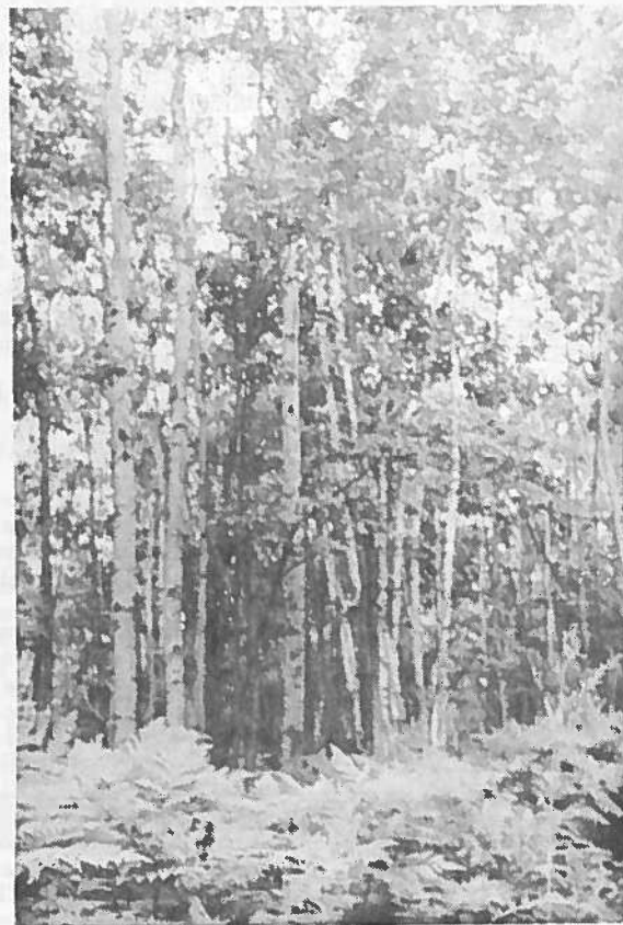
SUMMER ON THE ISLAND, ROE'S ACRES.