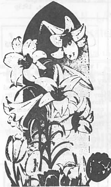
The Finest Easter Lilies Money Can Buy. Very Reasonable Prices.

We Welcome Your Patronage with Friendly and Efficient Service.