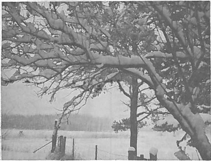
OLD MARCH IN MICHIGAN-- Sunday we had a sudden snowstorm that left us an added four inches of snow. This while the cardinals were whistling their spring song, and the chickadees were saying, "Chickadee-dee-dee," which they do only at autumn and spring, according to most authorities. Tuesday morning we woke up to freezing rain that closed schools and turned blacktop roads into solid glassy surfaces. That's March in Michigan. Oh, well, next month is good old April--we hope.