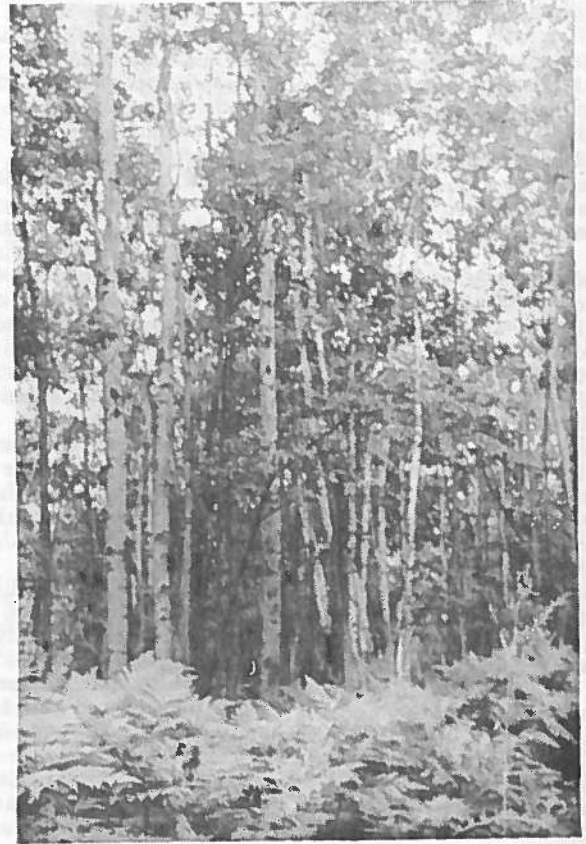
SUMMER ON THE ISLAND, ROE'S ACRES.