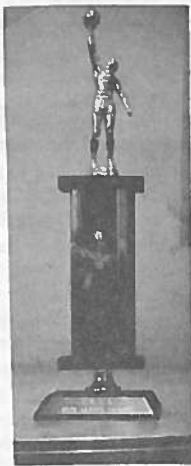
THIS IS THE TROPHY-- For the Boys' Team of Weidman, which was declared champion of the Chippewa Hills Community Basketball League. It is identical to that of the winning Weidman Women's Team, now enjoying the pleasure of displaying the graceful piece.