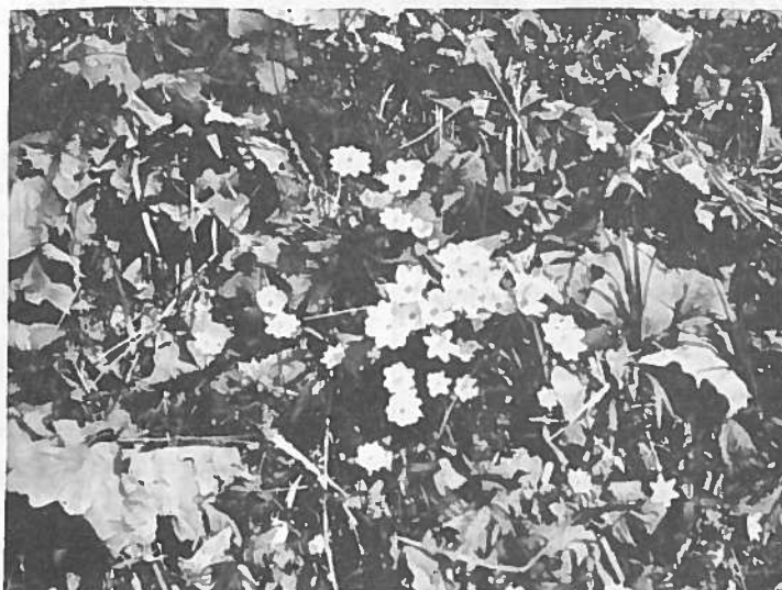
TAKE A GOOD LOOK--They'll be gone, one day. These are hepaticas, growing wild in a woodlot we know. They will not be here forever, as woodlots give way to housing developments, as at Bamber Woods in Mt. Pleasant. This week the woods are blue with the wild sweet William, and the sweet "wild lily", and other varieties.

We see by the school's shopper's guide (a private business enterprise carried on in St. Louis), that the architects hired by the Board of Education for the new school building will put forth another beautiful brochure with which to lure fond parents into