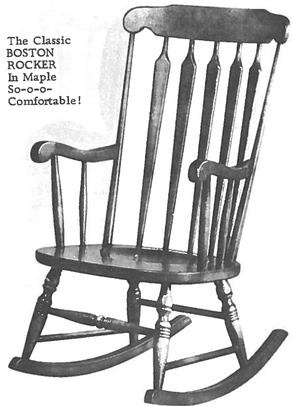
The Classic BOSTON ROCKER In Maple So-o-o-Comfortable!