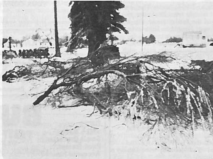
AFTER SUNDAY'S ICE STORM--We thought our yard was a doozy for litter of big tree limbs, but after viewing some others' woes, we decided we came off not so bad.