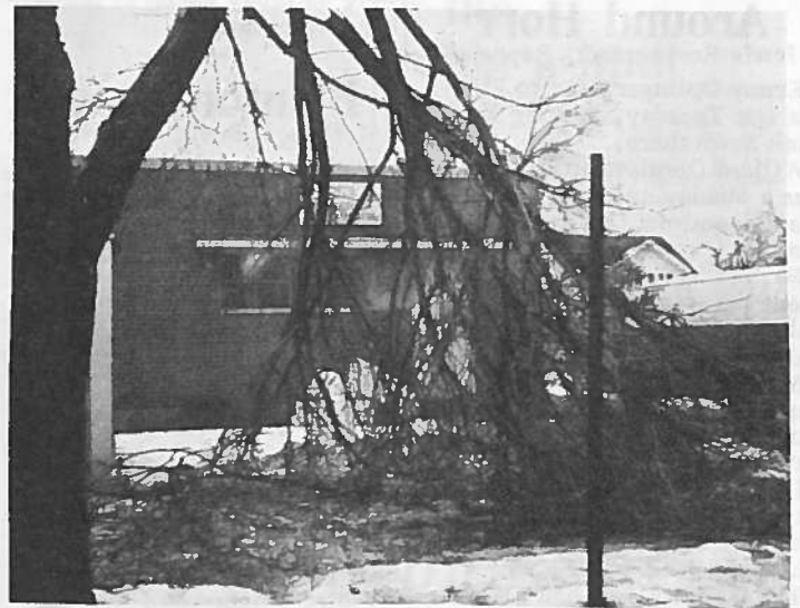
GENERAL TELEPHONE COMPANY'S BUILDING-- In Weidman had the usual ornaments of downed tree limbs in front of it. Damage to trees all over Isabella County was impossible to estimate, and Weidman got its share of grief.

Friday evening our work-lamp at the IBM typewriter went off, and we spent the evening taking it apart and getting it back together with no inkling of what ailed it, except that apparently it needed a new thingumajig at