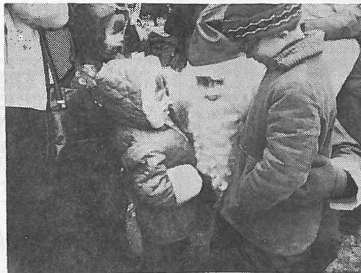
HE ARRIVED ON THE BIG RED FIRE TRUCK-- As usual here, and took kiddies in his arms for real personal chats. After he had talked with all the little ones here, Santa went over to Beal City on the big red truck, and left the remainder of his 300 bags of goodies there.