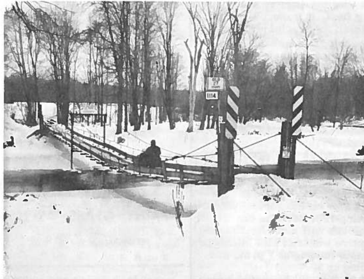
THE LIL' MAC BRIDGE--Where next Sunday's pig roast dinner will be held, observing the second anniversary of Lil' Mac Bridge Day, on the Elwood Miller farm. The bridge was built during the past two-three years entirely by snowmobile enthusiasts, and is for snowmobiles only. Engineering, footing and suspension-cable work all were done by local men, and it is a marvel of sound bridge building. It spans the Chippewa River on a west edge of the Miller farm. Some of its road signs are spoofs, and definitely the sign in the middle of the bridge is a laugh. (shown in photo below). Photos taken last year at the first celebration and pig roast in February.