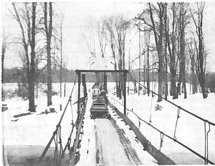
HERE'S A CLOSER VIEW OF A SPOOF SIGN READING: "Your Tax Dollars at Work". No tax dollars were used on the Lil' Mac Bridge--all the work on it was purely a labor of love--and enthusiasm of snowmobilers.

Lil' Mac admittance buttons are already appearing on coats and jackets throughout Isabella