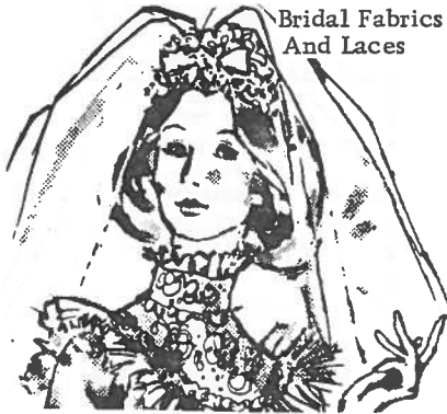
Bridal Fabrics And Laces

4½ Miles South of Clare, ¼ Mile West on Doherty Rd.