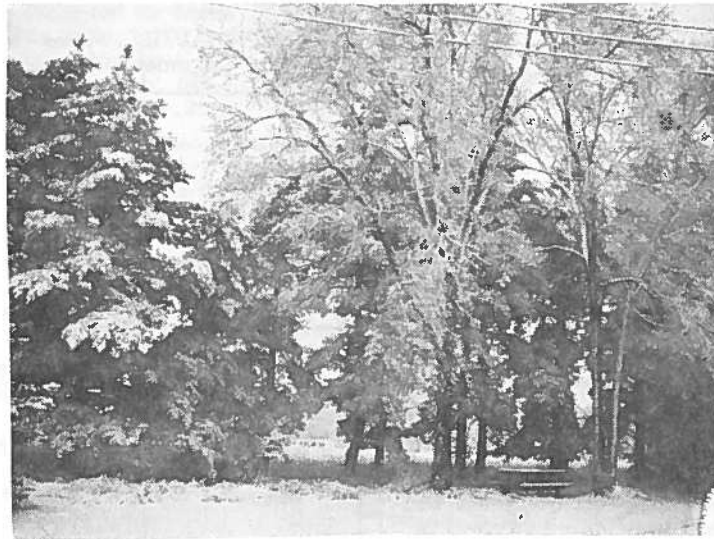
WE WERE BACK TO WINTER --Last Friday and Saturday, with a nasty ice storm that downed Tri-County Electric Company power lines north of Blanchard, affecting the west part of Isabella, including Weidman and Lake Isabella, and also the village of Barryton, for about three hours Saturday afternoon.