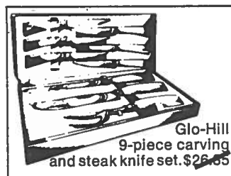
Glo-Hill 9-piece carving and steak knife set. $26.95

Father's Day Special $9.99 FATHER'S DAY IS SUNDAY, JUNE 16 Father's Day Special $18.88