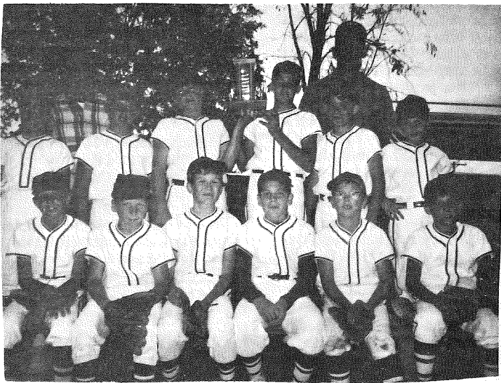
ISABELLA-MECOSTA LITTLE LEAGUE CHAMPS--Beal City Green became the 1970 champions of the Isabella-Mecosta Little League after defeating two other teams tied for first place.

The three teams each had won seven games and lost one. Saturday, July 25, Beal defeated a fine Barryton team, 14-2. They went on to take the title and trophy by putting down Mecosta in a hard-fought battle, by the score of 2 to 1 Wednesday, July 29.