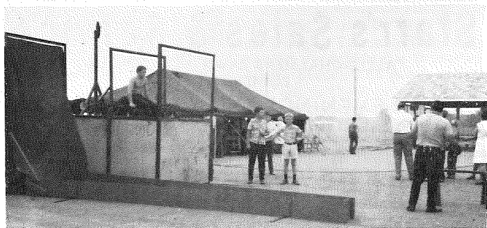
BEAL CITY KC BARBECUE AND FESTIVAL GOES OVER BIG, as usual. Besides the delicious dinner, served expertly, there were many games and amusements for young and old. There was even a dunking act, as shown above. We were there early, but the crowds were already present in the hundreds.

More than 800 adult chicken dinners were sold, and more than 300 dinners for children were dished up. There were around 450 takeout dinners. All of the 850 chickens purchased for the event were sold before the evening was over.