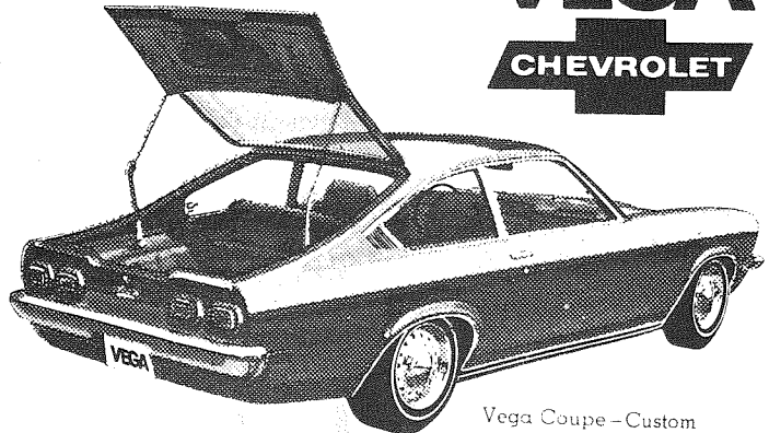
Vega Coupe - Custom

THE CAR THAT IS THE SENSATION OF THE NEW-CAR YEAR