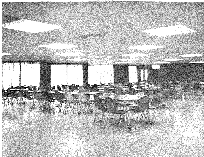
INTERIORS OF THE HUGE ONE-STORY BUILDING--Are pure elegance and luxury. Above is a part of the cafeteria, where tables are surrounded by gaily-colored form-fitting seats, and windows, draperies and lighting are of the highest quality. Classrooms also have the gay colored form-fitting seats with desk-arms, and the great area is entirely carpeted. Interiors are exquisitely finished, and the district now has one of the most beautiful and elaborately furnished high schools in the state.