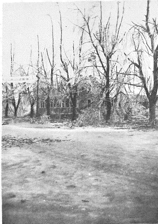
Y' THINK WE'VE HAD BAD WEATHER?--The above photo was taken after an ice storm hit Weidman in 1922--just about 50 years ago. View shows the old George Drallette house on West Main Street, with trees sheared of limbs and power wires carrying a load of ice weighing 12 pounds per foot of line.

We are losing our property rights through the proven method