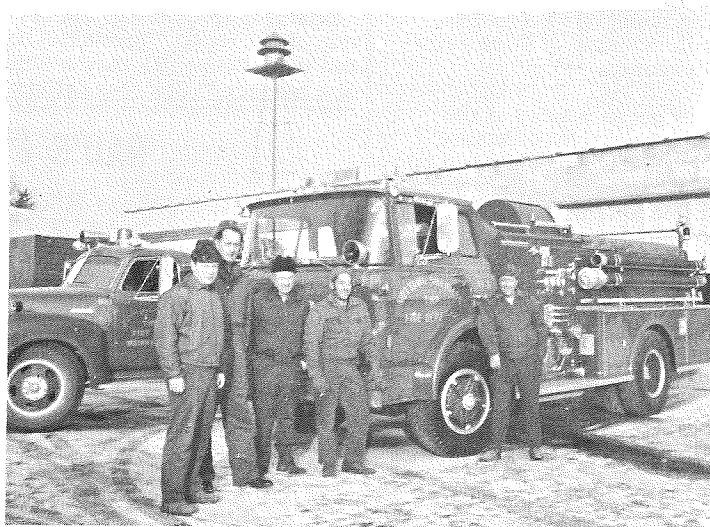
SOME HAPPY MEMBERS OF THE NOTTAWA & SHERMAN Volunteer Fire Department started getting acquainted with the brand-new fire truck which arrived in Weidman Friday afternoon, late. To the left is the old 1949 truck with which the Firemen have been working since that date--1949. The new truck has all fire-fighting equipment on it a Fire Department could ask for--and local Firemen are indeed happy.