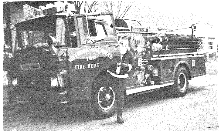
SANTA CLAUS ARRIVED ON THE NEW FIRE TRUCK --Saturday afternoon, and Weidman's biggest crowd of kids (with mothers) came to talk with him.