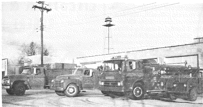
HERE'S THE ENTIRE OUTFIT THE FIREMEN NOW HAVE: At far left, the water-tank truck; the old 1949 fire truck; the new 1972 fire truck; and (far right) a jeep donated by the DNR and outfitted by the Firemen for grass fire-fighting. The area now has a first-class fire-fighting fleet--and first-class Firemen to operate it.

ens. A delicious pot-luck Christmas dinner was enjoyed by all, after the card-playing.