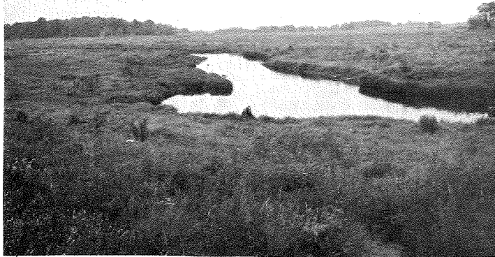
THIS WAS THE WEIDMAN MILL POND--Where you had the greatest fishing in the State. Since the breaking down of the east-side dike in the 1969 June flood rains, the poor old Mill Pond has grown up to great green swamp-weeds, with only the narrow channel of the Coldwater River running through what used to be taken for granted as a forever thing for sportsmen and swimmers in this area.

We can feed the birds, and we do; we can thrill to the sight of