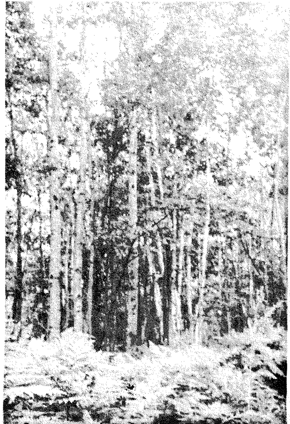
SUMMER ON THE ISLAND, ROE'S ACRES.