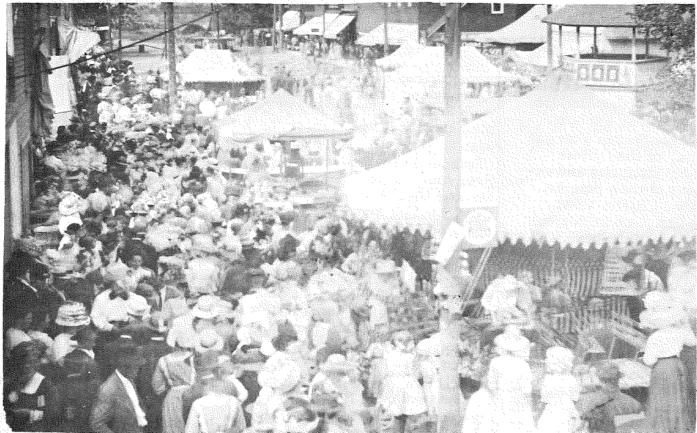
AN OLD TIME WEIDMAN DAY --Probably shortly after the turn of the century, judging by the styles shown. This photo was found by Leila Shook, who purchased the former Eva Carr home in Weidman, and the picture evidently was one Eva saved. The scene is from the west side of the business street, looking north (Drallette's Store is identifiable, with its outside stairway going up to the Masonic Hall.) Weidman Day was a holiday when folks met old friends gathered here, and picnic dinners used to be the thing; notice that there are no carnival rides on the street for the above Weidman Day, just some tents, and people. To the right is the old bandstand, which stood smack in the middle of the intersection of Main and Third Streets (Weidman bands made music there, too). Weidman Day was instituted about 1896, when John S. Weidman spear-headed a "field day", and it went over so big it became an annual affair known as Weidman Day, until recent modern times.