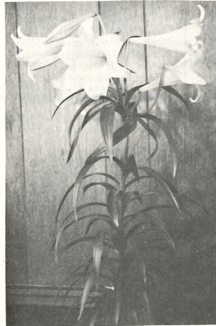
Actual Photo of One Of Our Lily Plants.