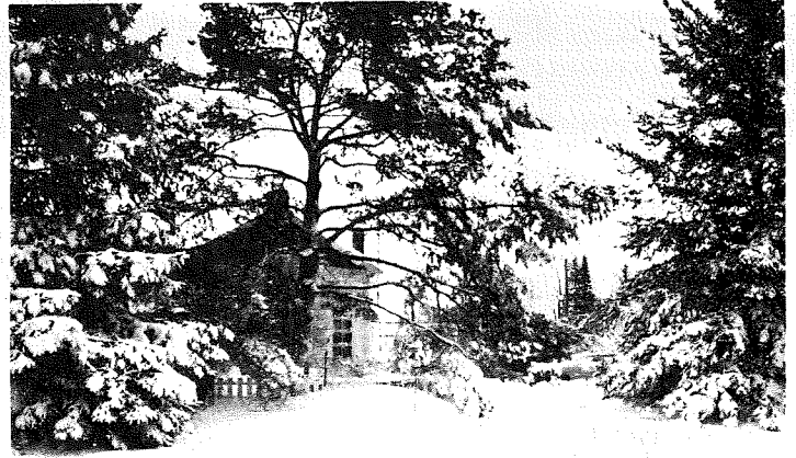
SPRING IN MICHIGAN, 1971--The worst storm of the winter of 1971 came on us March 18 and lasted three days, according to our Messenger files. The caption remarked, "Meanwhile, spring birds are arriving daily, most of them having showed at our place except the meadow lark, which apparently has sense." This year we hope for better luck.

Reminds them of you fifty times a year. Birthdays, Anniversaries, holidays.