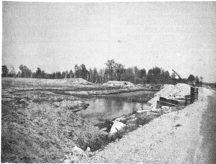
THE MILL POND WILL SOON BE LAKE WEIDMAN--Allen Lumber Company's big machines have been working on the dikes on the east side which gave way in flood rains three years ago. The dikes have been rebuilt good and high, with two emergency overflow areas just above normal water levels, to empty into the drain going under the Mill Road and into the Pond below the dam. The dam itself will be rebuilt. Sources close to the project said this week that we can expect to have water back in the beloved old Mill Pond this summer, barring unforeseen difficulties.

Jorgensen is frankly the political issue in this School Board