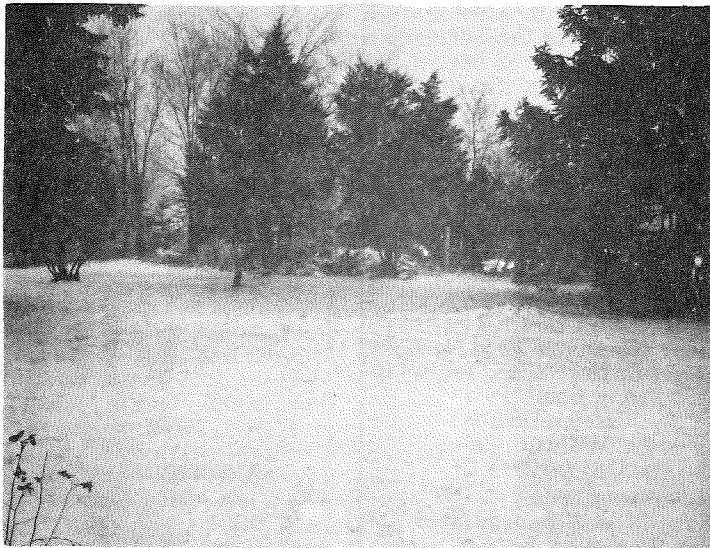
MONDAY, DEC. 1--Temp. 14, snow, winter back. Same lawn, same location. Winter came suddenly, here, and to stay. Now we're in the tight-cold area of the season, for a couple of months--but look over your seed catalogues, order seeds and plants--and first thing you know it'll be spring!