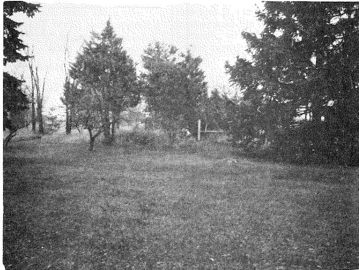
SUNDAY, NOVEMBER 30--Temp. 50, clean green grass, a soft breeze that felt like spring.

Besides its own newspaper, the village of Weidman has a zillion other things to be proud of: Our business district, concentrated on one block of Woodruff Road (downtown Weidman), continues (Continued on Back Page)