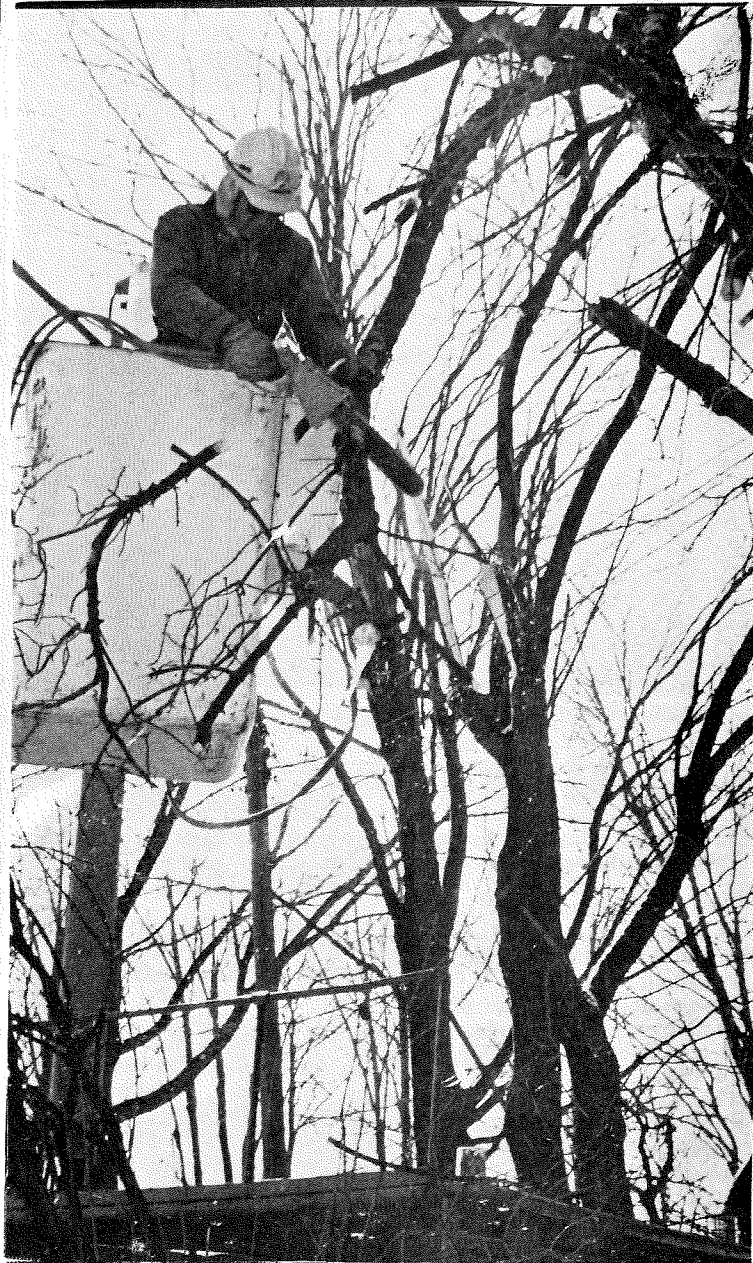
CONSUMERS POWER LINEMAN--'Nuff said. As a matter of fact, all power companies' field men did heroic work after last week's devastating storm.