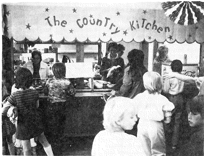
THE COUNTRY KITCHEN--Was a popular spot at the school Carnival here Saturday evening. Kids (and grownups, too) flocked to get goodies at the counter.

HOME PAPER FOR THE WEST HALF OF ISABELLA COUNTY