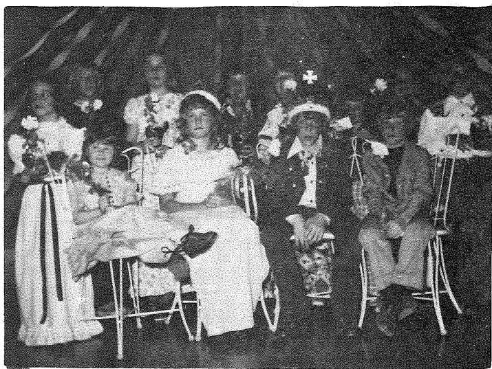
AT THE WEIDMAN SCHOOL CARNIVAL--Saturday evening. Above are the King and Queen of the Carnival, and their Princes and Princesses, and their Court.

The Weidman Spring Carnival, held Saturday evening at the Weidman School, was a very successful event, sponsored by the Weidman Mothers Club.