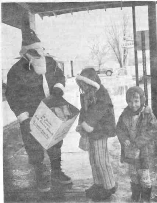
SANTA CAME TO WEIDMAN--And bashful young fry stopped to chat with him and have a bag of candy. Santa comes here at the invitation of the Weidman Business Association, and WBA members help Santa by filling the candy-bags in advance for him.