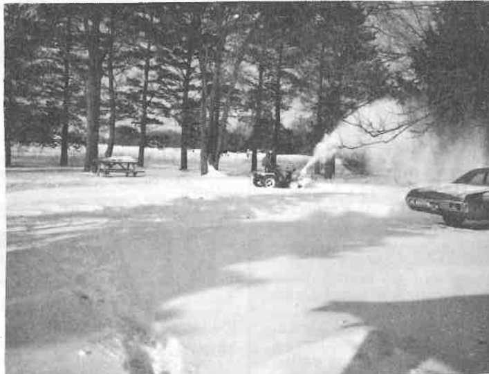
WE'VE ALWAYS SAID--That Michigan's January and February are simply two months to get rid of. We've almost made it--though Monday's ice, snow and wind storm was not encouraging. Maybe March will be civilized.