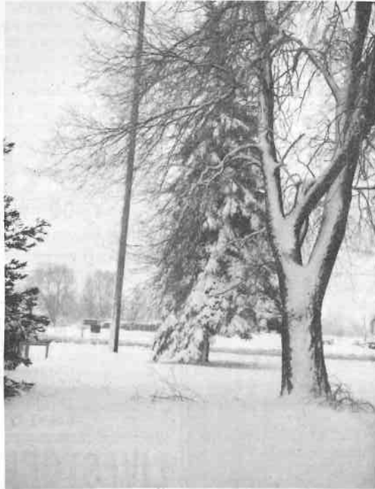
CALM AFTER WHAT A STORM!--Around here we looked like this Tuesday morning after intermittent blizzards, snow storms and driving winds from Saturday night through Monday.

There the classes were separated into elementary, and two (Continued on Back Page)