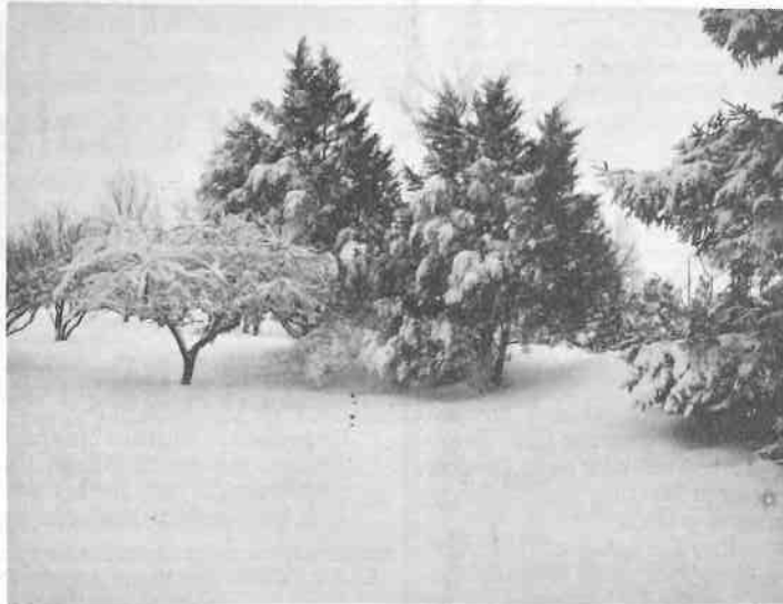
SPRING IN MICHIGAN, 1971--The flowering crab tree is in bloom--but not with its usual deep-pink blossoms. That's snow on its branches, laid down by the winter's worst and longest-lasting storm which began Thursday night and continued through Saturday.

Michigan is not the only state (Continued on Back Page)