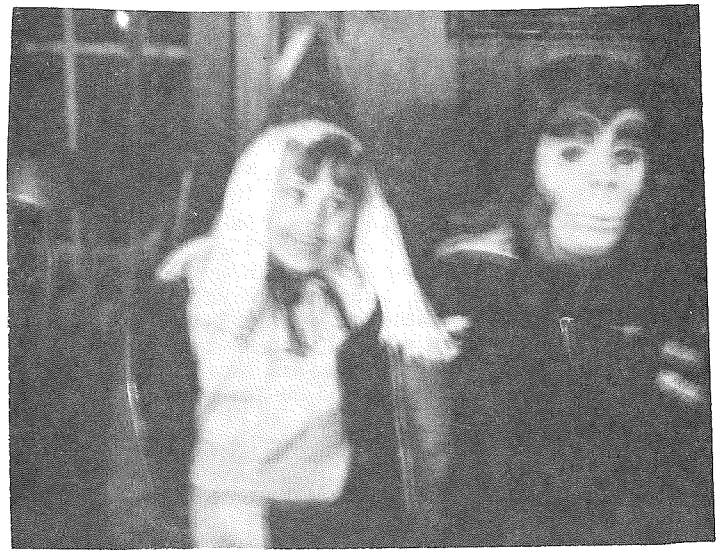
SOME OF OUR HALLOWE'EN CALLERS--Included even King Kong, as the photo above shows.

HOME PAPER FOR THE WEST HALF OF ISABELLA COUNTY.