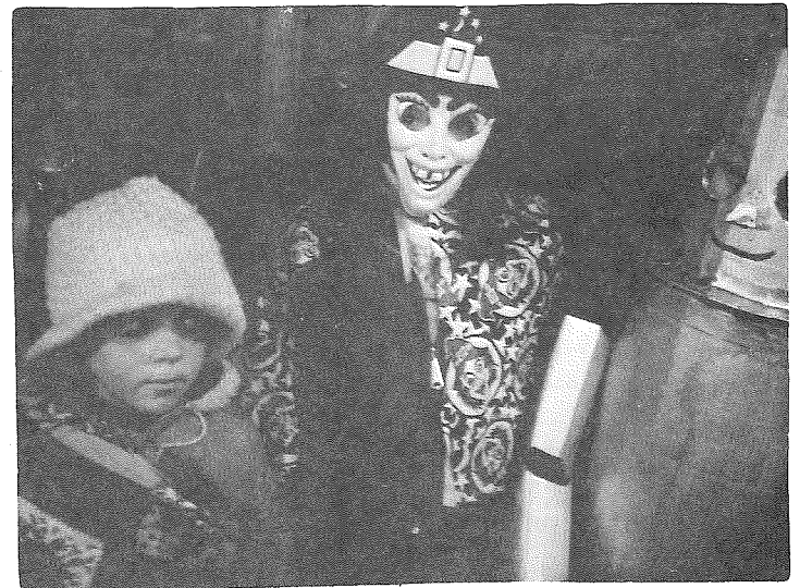
THE TIN MAN--Was one of our featured visitors Hallowe'en night (extreme right, above). Also faces like the one of the middle really gave us that old spooky feeling. We felt we never had so many nice kids, in so many different kinds of costumes. Note the small one in lower right-hand corner, above. Typical. Lovely.