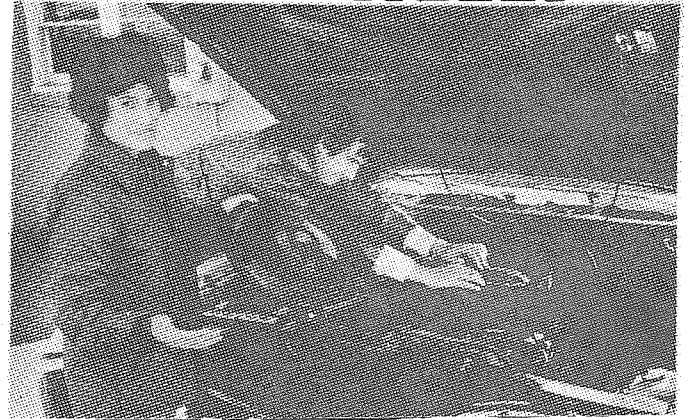
When your car has had it