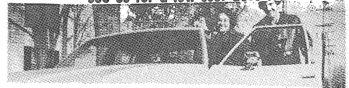
and enjoy the new car feeling!

If your car's on its last wheel... see us about an auto loan. Just tell us how much is needed for that new car, and we'll set your loan application into high gear. You'll have the word in no time! Plus we'll design a payment plan that best suits your budget. Interest rates on our loans are always the lowest.