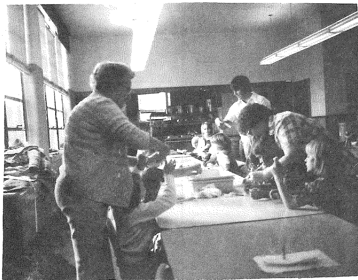
TWO ROWS OF TABLES--Held a lot of small girls earnestly learning to make corn-husk dolls and figures.