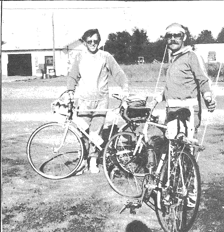
350 BICYCLISTS GO THROUGH WEIDMAN-- Friday morning as they head for the Mackinac Bridge to take part in the annual Labor Day "walkover". They came not in caravans, but carefully and sensibly, in twos and threes, taking back roads (which are paved, of course, in this day and age) to avoid the Labor Day weekend traffic.