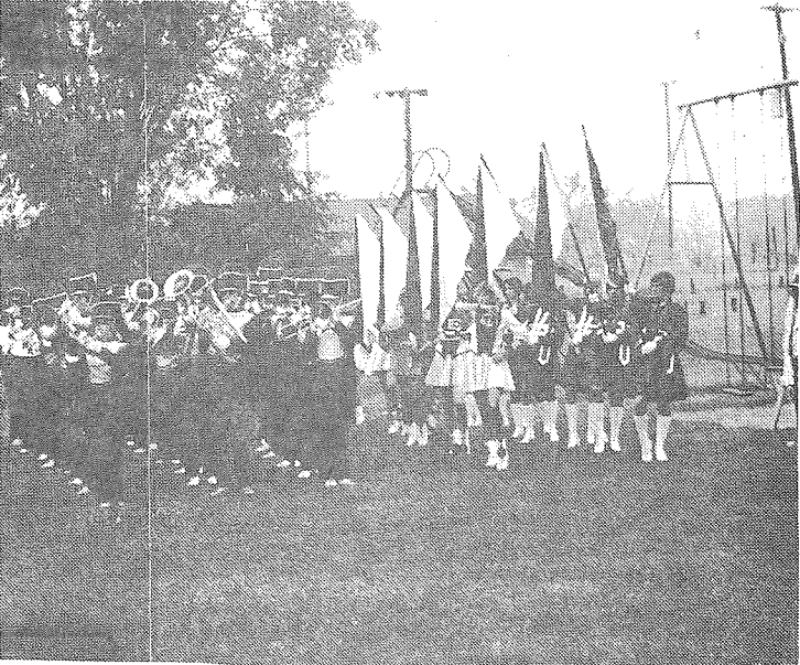
The band got a nice writeup and two pictures in the Sept. 2 issue, showing the band as it appeared at the Baltimore Colts (the Lions won by a wide