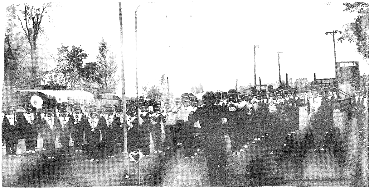
THE CHIPPEWA HILLS MARCHING BAND--As it appeared here last Memorial Day in the magazine "Pro!", official publication of the National Football League, in at Pontiac Stadium at half-time in the recent game between the Detroit Lions (margin), and the band did itself proud at the game.

EXPIRATION--Of your subscription date appears each week beside your address.