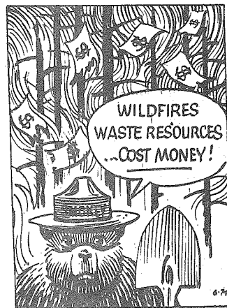
---Help Prevent All Wildfires!